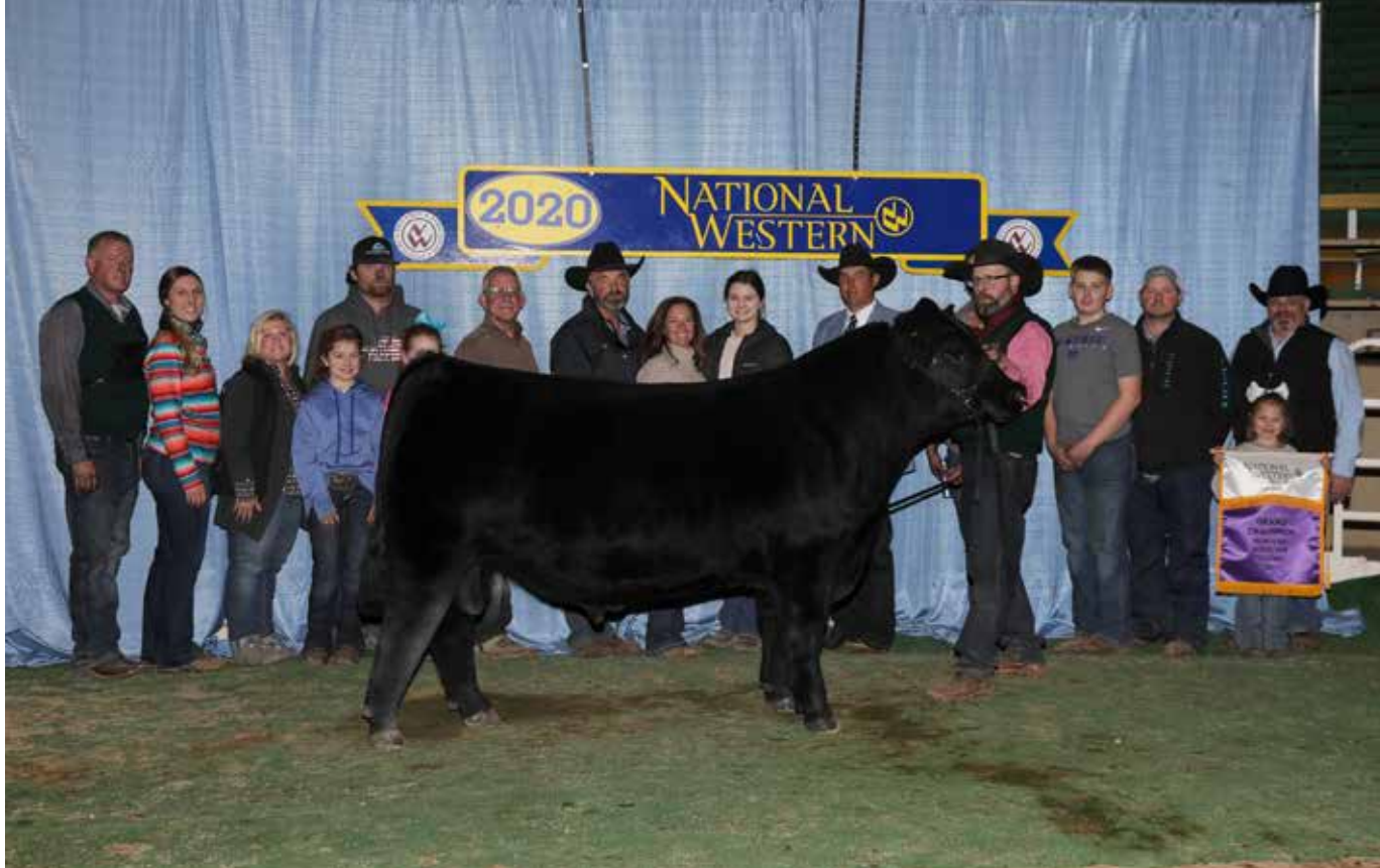
REBEL YELL | NWSS GRAND CHAMPION BALANCER BULL