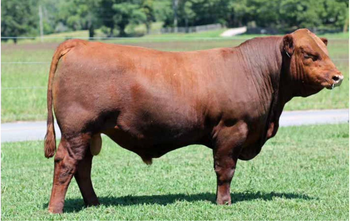
470B | SOLD FOR $6,800