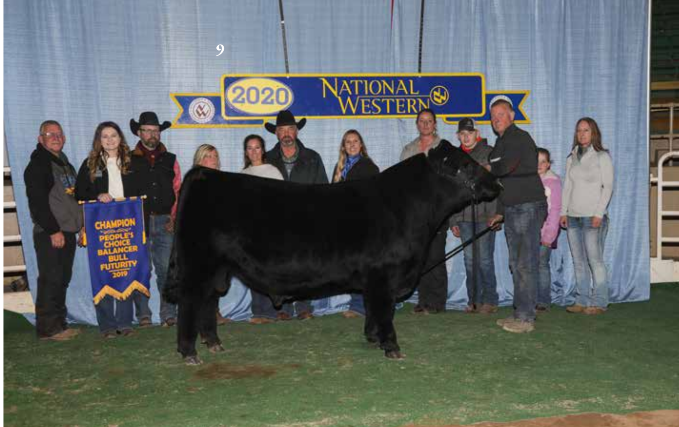
REBEL YELL | NWSS BALANCER BULL FUTURITY CHAMPION