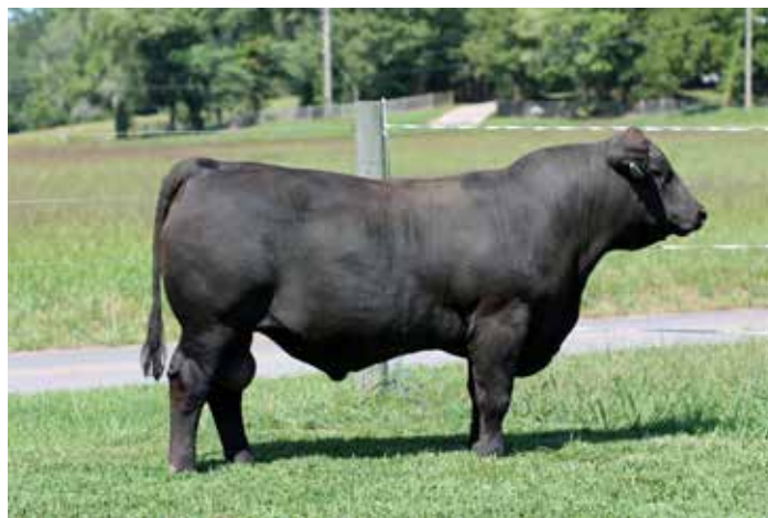
417B | F921U SON SELLING FOR $8,000