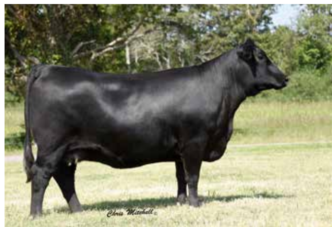
839F | RUSTY VAIL DAUGHTER

Once again you can invest in genetics combining some exciting new donors and sires. This mating of femininity and power should work. We also put a few of these in for next year. These will be HP BA75 progeny.