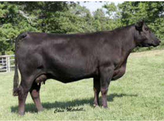
913U | 3 RD GENERATION DAM