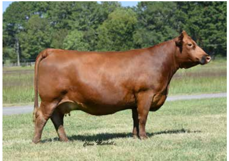
149X | GRANDDAM OF 588C