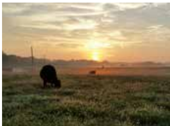
TCC RITA 018