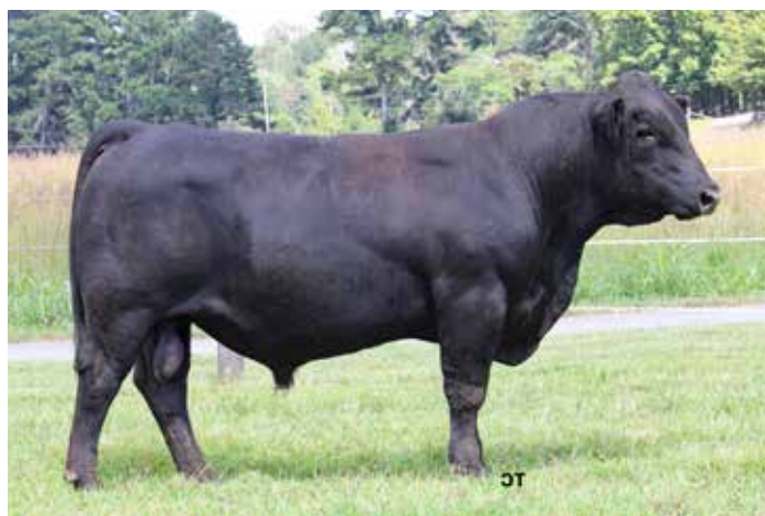
6124E | 921U SON SELLING FOR $4,200