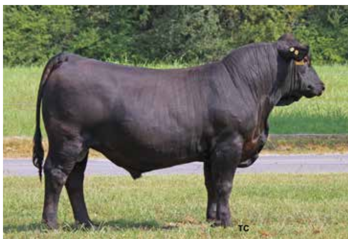
882F | SOLD FOR $3,900 TO STEVE BAYNE