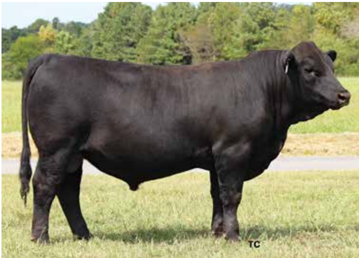
851F | SON SOLD TO CEDAR TOP/WARNER BEEF FOR $9,000