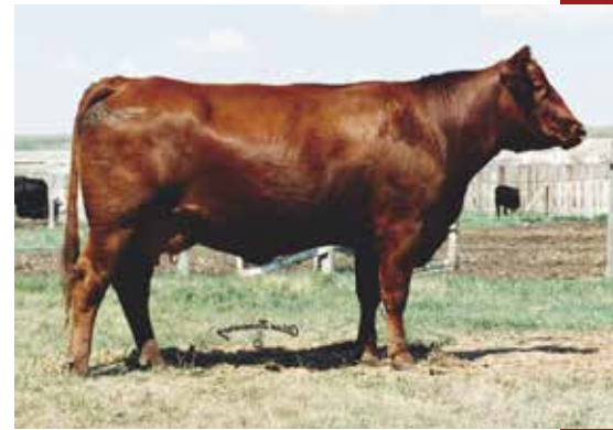
61Y | 6 TH GENERATION DAM