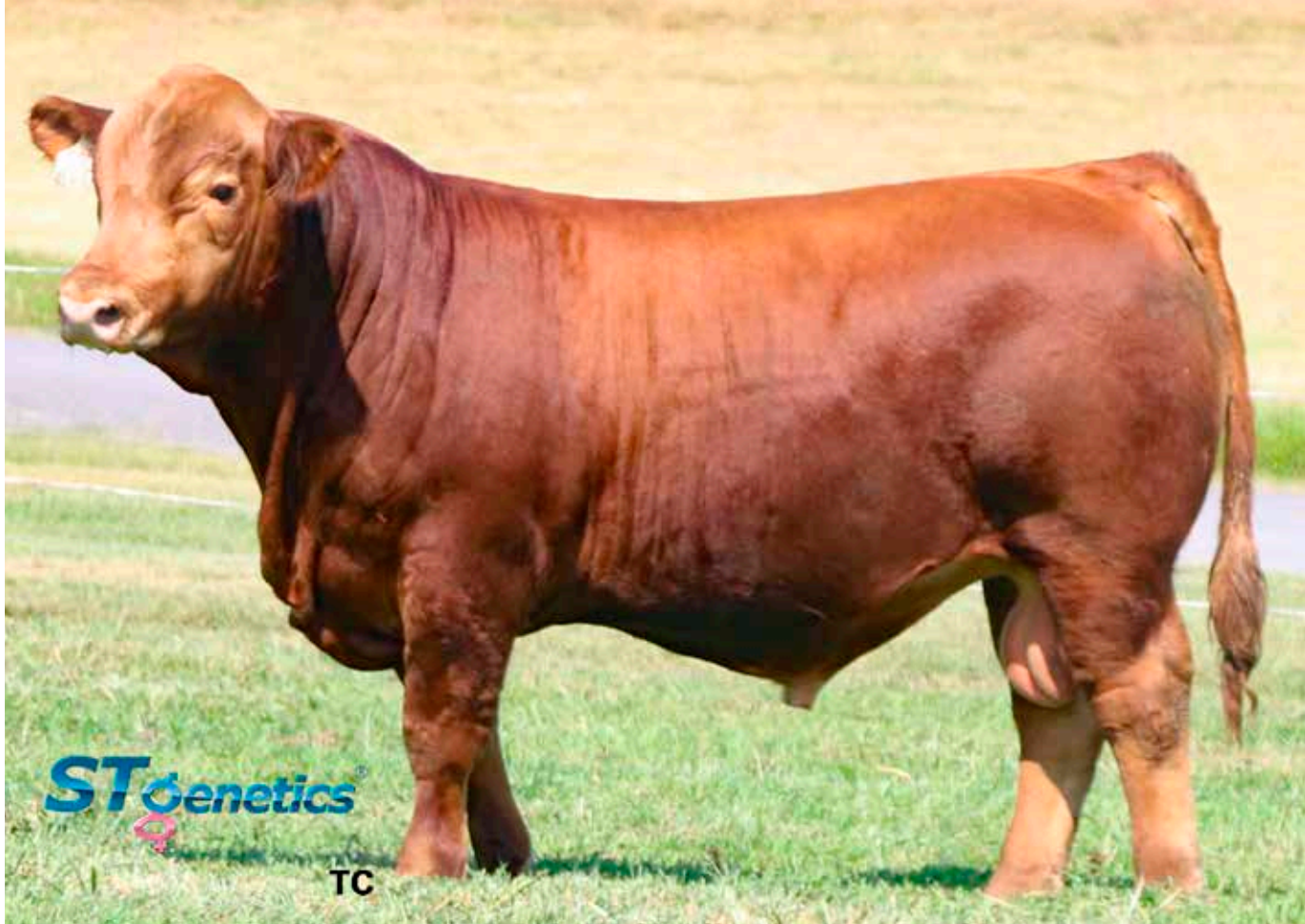
TJB DOMINIC 844F | SOLD LAST FALL FOR $20,000 THEN LEASED TO STGENETICS