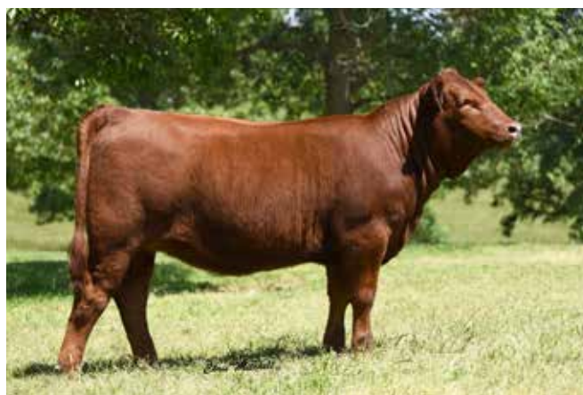
RIGHT COMBINATION | SIRE OF EMBRYO LOTS 18 & 19