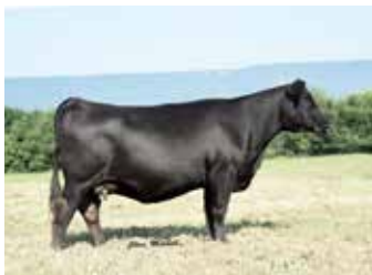
TJB ANISSA 495B