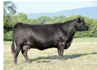
TJB BLACKCAP 130X