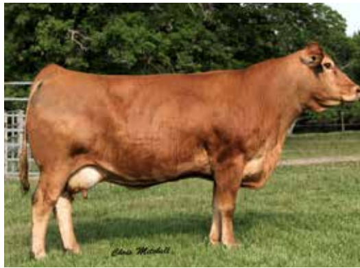
337M | 4 TH GENERATION DAM