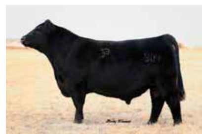
REBEL YELL | SIRE OF LOT 32

Unbelievable potential in this mating. The complementarity of Angus and Gelbvieh will be at it's very best. Buy these with extreme optimism!