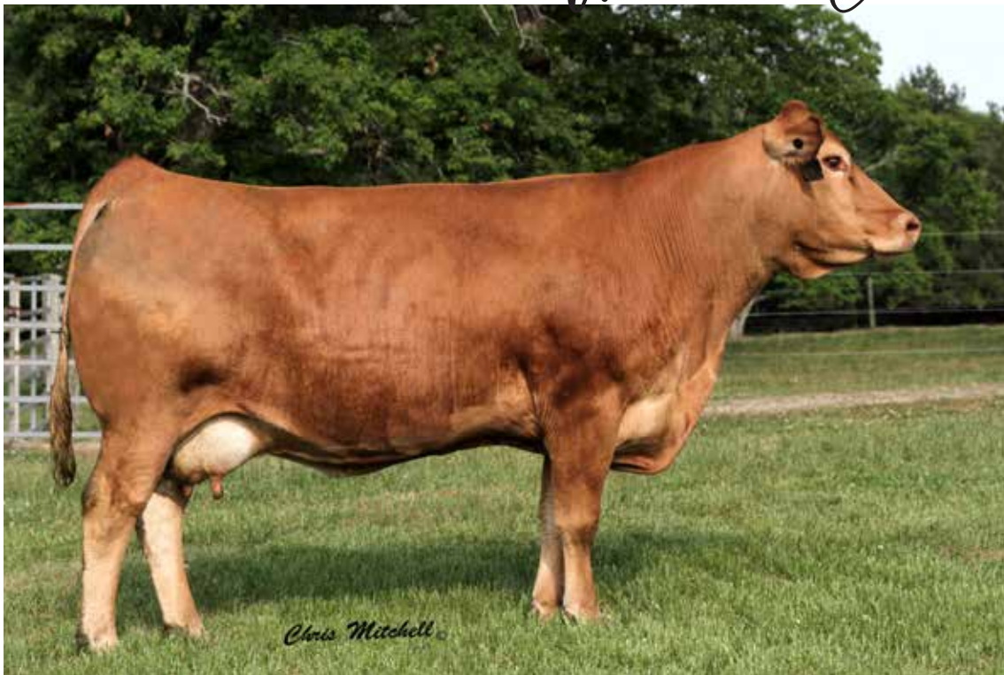
337M | DAM OF 921U