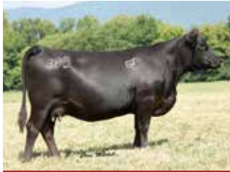
TJB ANISSA 588C