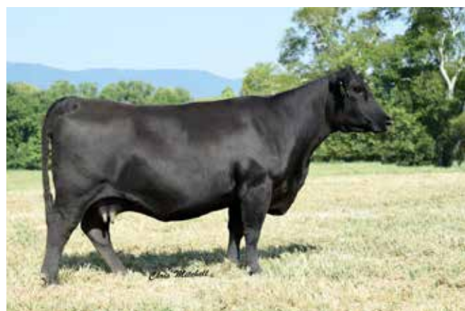
4102C | SANDHILLS DAUGHTER & DONOR FOR TJB

These embryos are sired by Green Hills Gelbvieh sire, Blues Impact. He has made quite a mark in their herd with numerous show champions. Although the numbers won't excite you, the progeny from these embryos will!