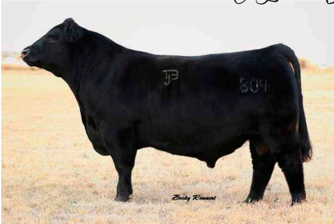
REBEL YELL | SON OF 921U