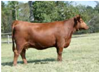
TJB VANESSA 4101C