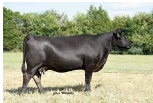
5135D | SOLD FOR $6,500 TO HADDEN RANCH