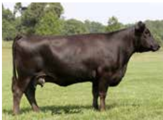
TJB BLACKCAP 823T