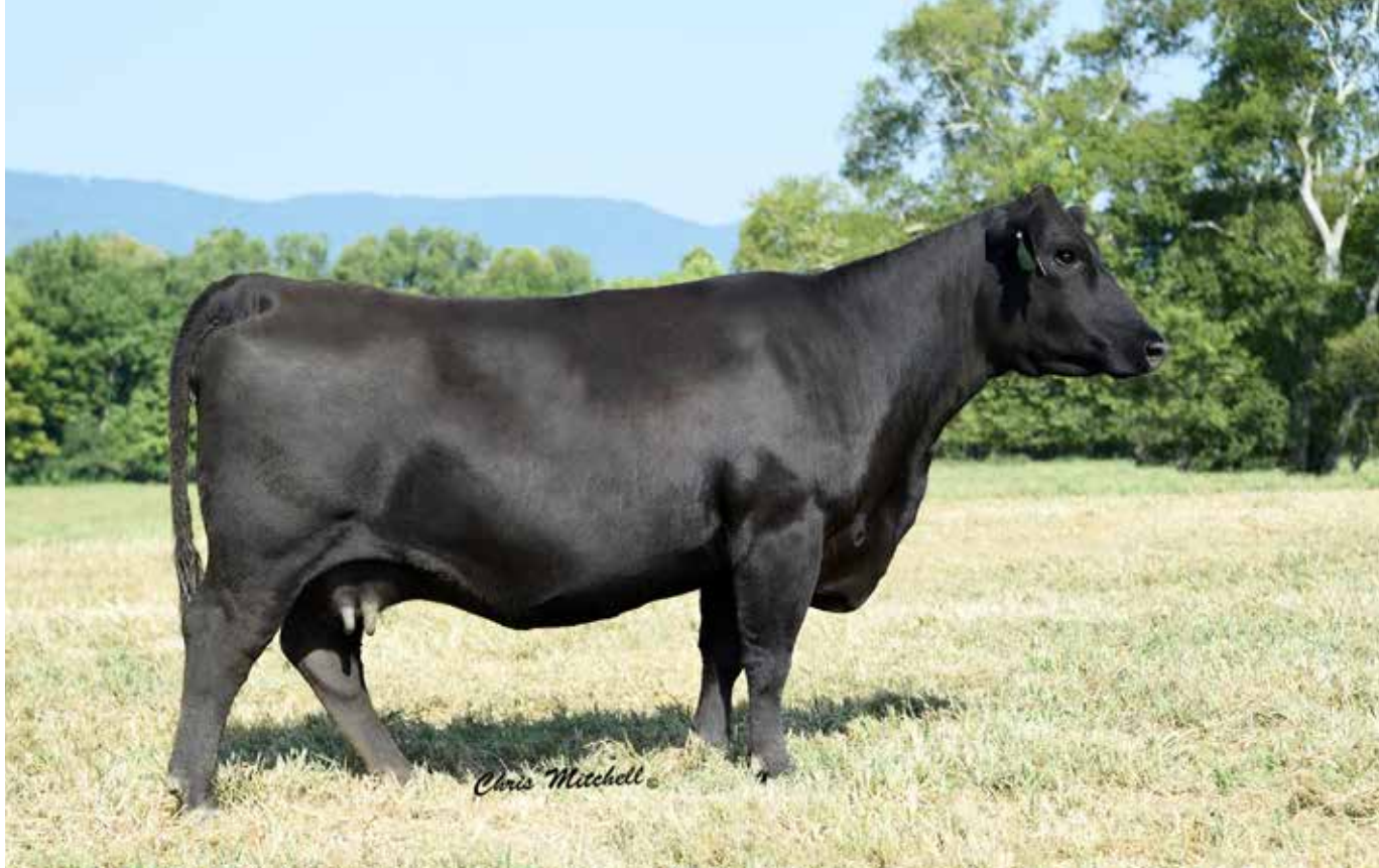
4102C | MATERNAL SISTER TO 579C

716E | DAUGHTER SELLING TO TRANS PACIFIC GENETICS FOR $4,200