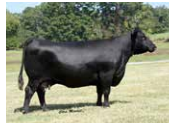
TJB VANESSA 914U