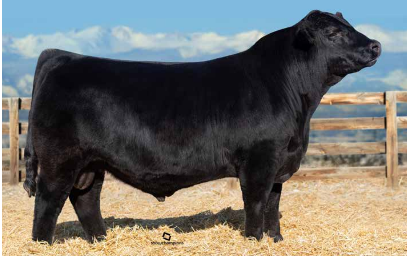
FRONTRUNNER | SIRE OF EMBRYOS