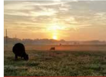
TJB ANISSA 579C