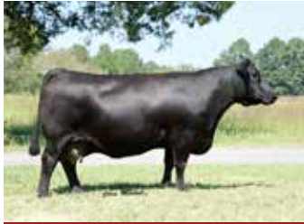
TJB ANISSA 921U