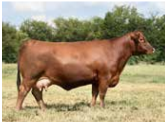
TJB BLACKBIRD 410B